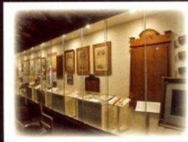
The Boys from Burragorang and Beyond WW1

our exhibitions tell the unique stories of the people and places of Wollondilly Shire & Burragorang Valley