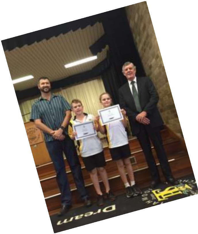
Rielly and Skye, Ministers for Environment with our special guests.