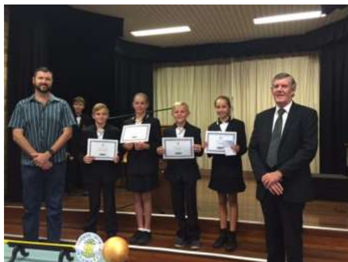
Our school leaders with our special guests.