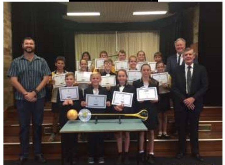
The Front Bench with special guests and Principal.