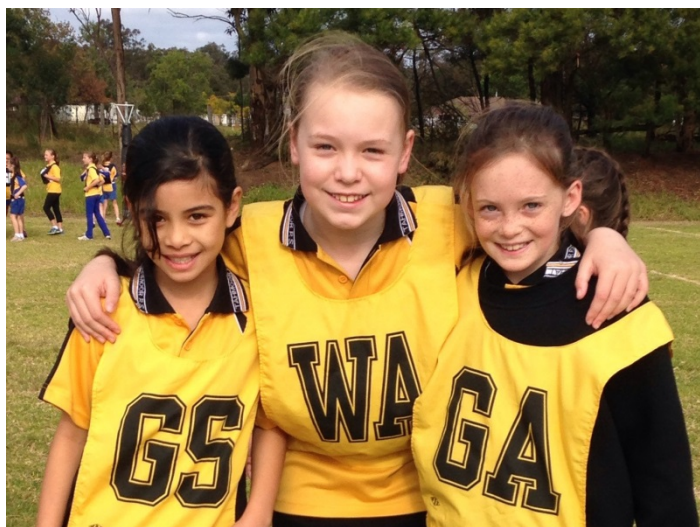
Fun times at the netball gala day.